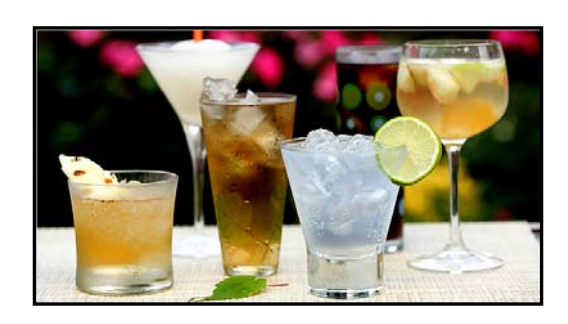
IF YOU ARE SERVING ALCOHOL

You must file your temporary use permit with the Planning Director who may approve or disapprove the permit and may also require other conditions. Depending upon the type of event you are planning, you may also be required to pay a refundable cleaning deposit. The Planning Department is located at El Centro City Hall, 1275 Main Street, El Centro and their telephone number is 760-337-4545.