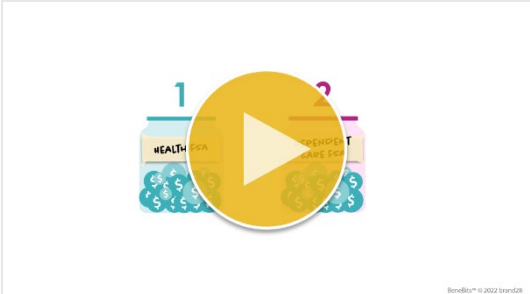
Click to play video