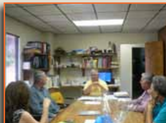
McNeece Oil Co.