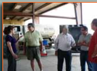
Elms Equipment Rental