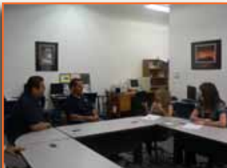
Air Cool Plus

A small part of what we do; a big impact on the way we do business.