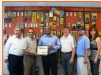
One Source Distributors