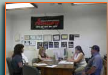
Cool Breeze AC